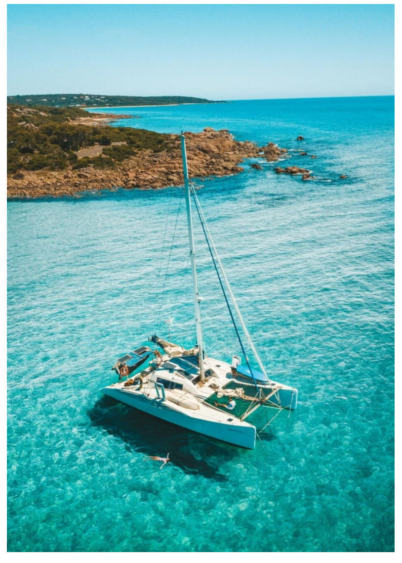
5 Day Expedition Sails