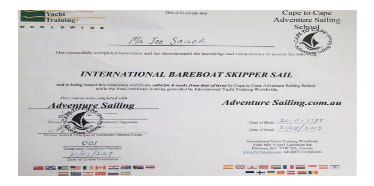
Let us help you fulfill your adventure dreams.